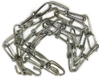
Hook and Chain