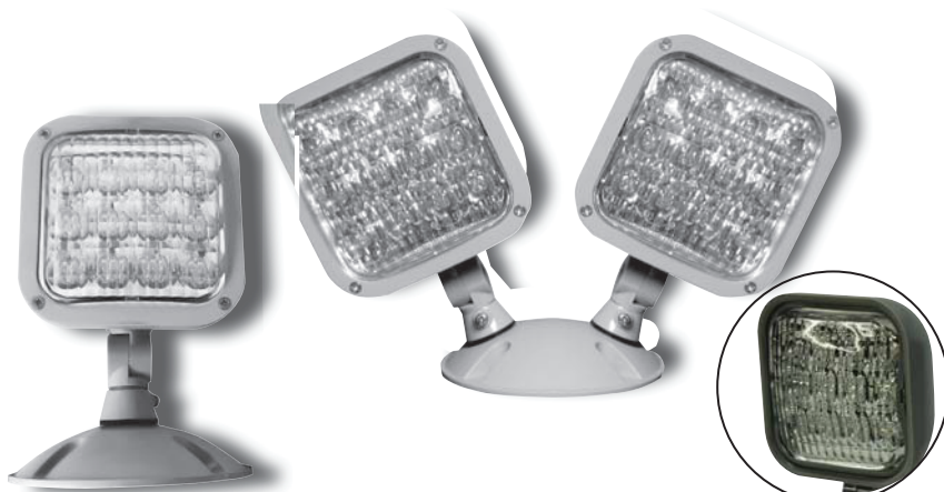
Also available in Thermoplastic